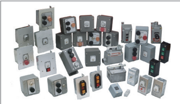
Complete selection of control stations & accessories are available.

All door operators are required to have a monitored safety system, such as monitored photo eyes and/ or monitored 2 or 4 wire obstruction sensing edge. In addition, an ancillary device may be used. The primary device must be a constantly monitored, anti entrapment/safety device.