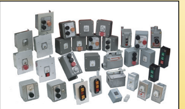
Complete selection of control stations & accessories are available.

All gate operators must have contact and non-contact sensing system installed for operator to work properly and safely.