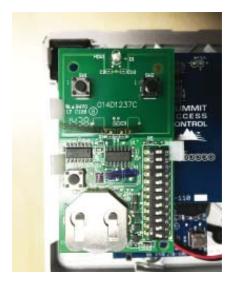
Transmitter Circuit Board

This model S-14-100-375UT unit incorporates a radio transmitter and can be programmed to control a wide variety of garage door openers, gate operators, and commercial door operators. Please see the auxiliary instruction sheet for detailed instructions for programming the transmitter.