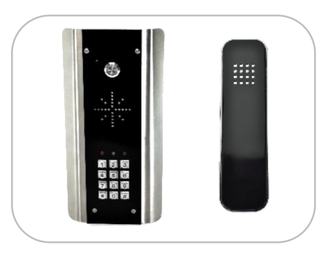
SLIM-HF-ABK (Architectural Keypad Model)