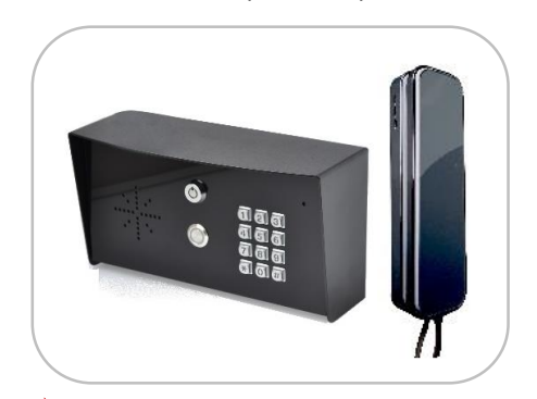
SLIM-CL-IMPK-PE (Industrial Model with Keypad)