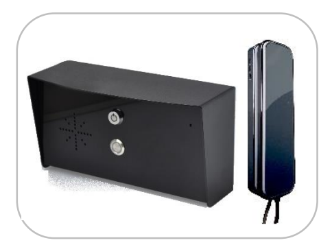
SLIM-CL-IMP-PE (Industrial Model)