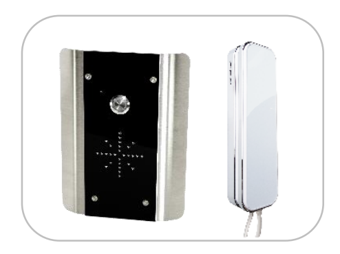
SLIM-CL-AB-W (Architectural Model)