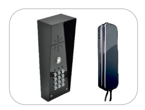
SLIM-CL-IMPK (Imperial Model with Keypad)