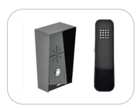
SLIM-HF-IMP (Imperial Model)