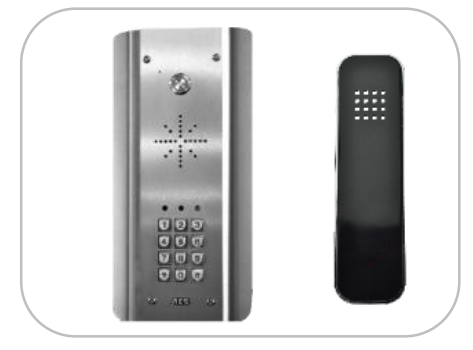
SLIM-HF-ASK (Architectural Keypad Model)