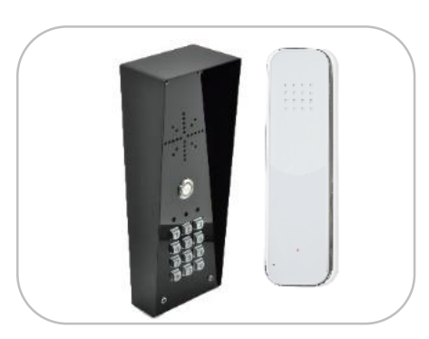
SLIM-HF-IMPK-W (Imperial Model with Keypad)