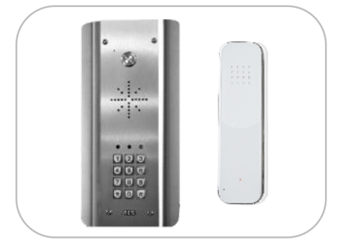
SLIM-HF-ASK-W (Architectural Keypad Model)