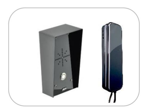
SLIM-CL-IMP (Imperial Model)