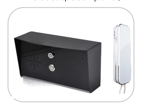
SLIM-CL-IMP-PE-W (Industrial Model)