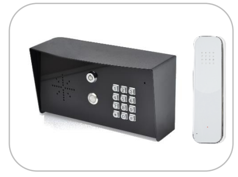
SLIM-HF-IMPK-PE-W (Industrial Model with Keypad)