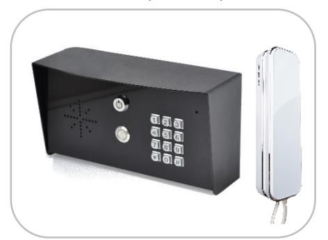
SLIM-CL-IMPK-PE-W (Industrial Model with Keypad)