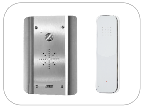
SLIM-HF-AS-W (Architectural Model)