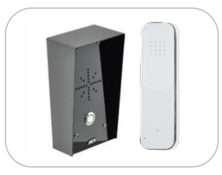
SLIM-HF-IMP-W (Imperial Model)