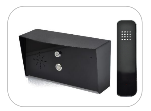
SLIM-HF-IMP-PE (Industrial Model)