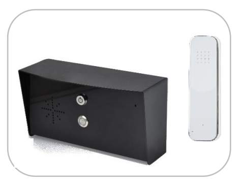
SLIM-HF-IMP-PE-W (Industrial Model)