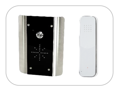
SLIM-HF-AB-W (Architectural Model)