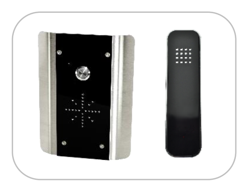
SLIM-HF-AB (Architectural Model)