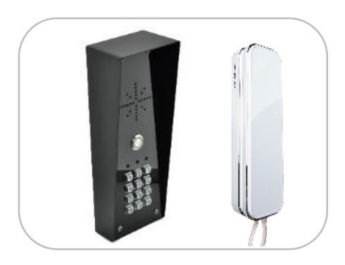
SLIM-CL-IMPK-W (Imperial Model with Keypad)