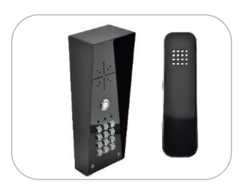
SLIM-HF-IMPK (Imperial Model with Keypad)