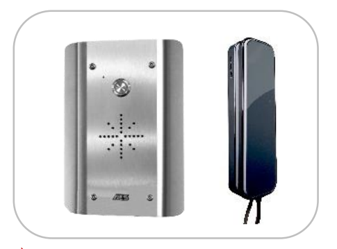
SLIM-CL-AS (Architectural Model)