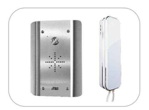
SLIM-CL-AS-W (Architectural Model)