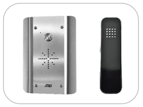
SLIM-HF-AS (Architectural Model)