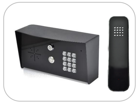
SLIM-HF-IMPK-PE (Industrial Model with Keypad)