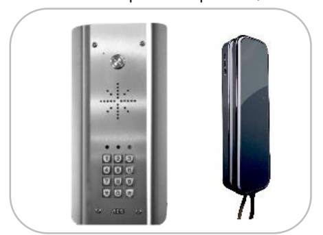
SLIM-CL-ASK (Architectural Keypad Model)