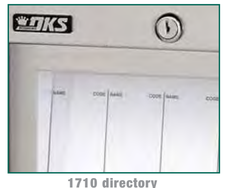
is lighted and uses standard paper for the printed directory using your computer and printer