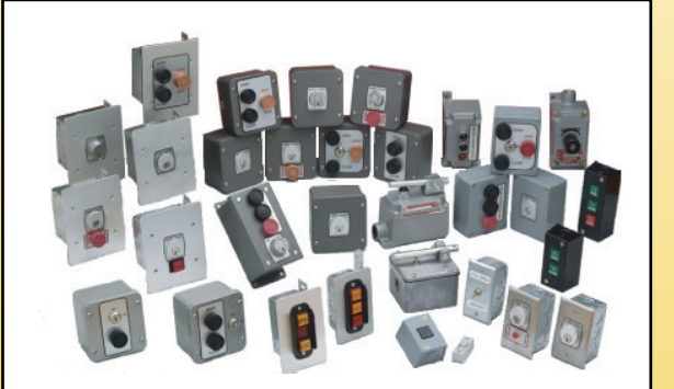
Complete selection of control stations & accessories are available.

All door operators are required to have a monitored safety system, such as monitored photo eyes and/or monitored 2 or 4 wire obstruction sensing edge. In addition, an ancillary device may be used. The primary device must be a constantly monitored, anti entrapment/safety device.