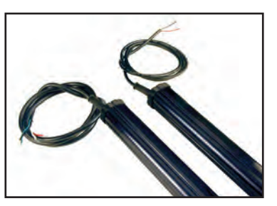
Receiver (left) Emitter (right)