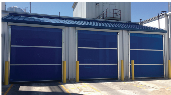
(Shown: Automatic Roll-up with Aluminum Hinge Option)

Interlocking brush seal is incorporated at the top of the tracks. If the door is forced out of the tracks by accidental impact, it is designed to help automatically reset the curtain back into the guides. Our fiberglass windbars remain flexible enough to pop out on impact preventing breakage. Aluminum hinge option available for higher wind areas.