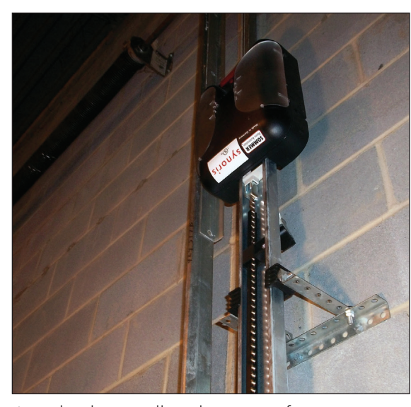
Attached to wall with proper fasteners.