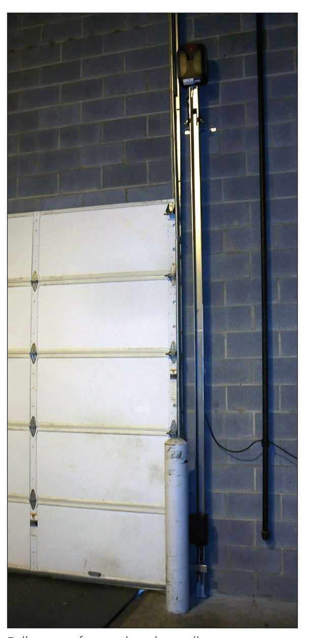
Full view of completed installation.