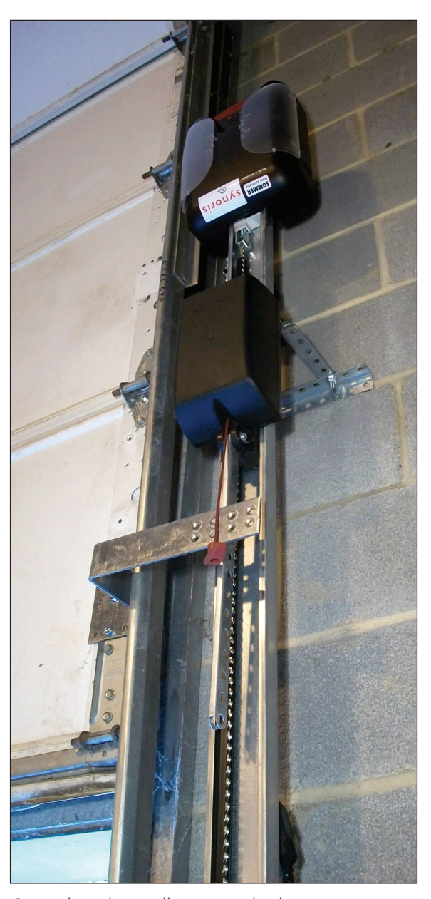
Completed installation with door open.

FOR DOORS TALLER THAN 12 FEET: CIRCUIT BOARD MUST BE PRE-PROGRAMMED FOR EXTENDED RUNTIME.