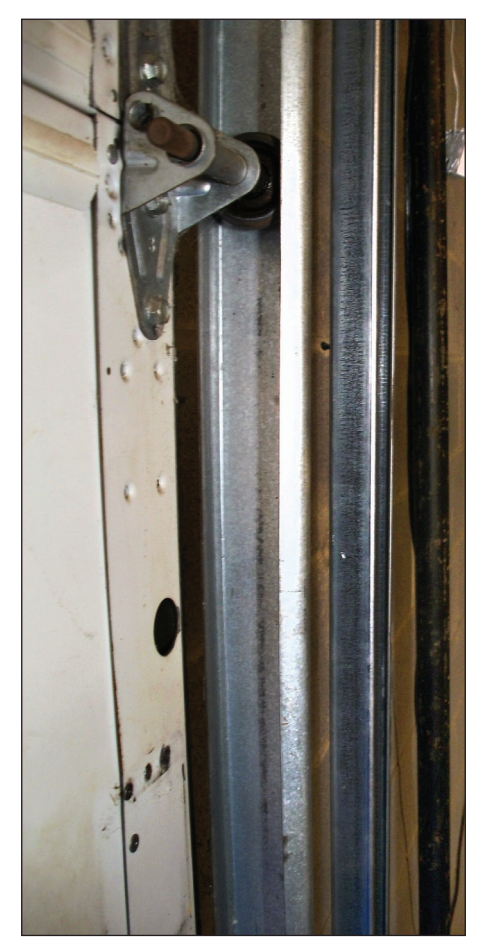
Rail and track parallel front to back.

6. Finish installation per installation manual.