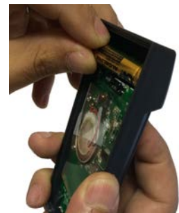
Figure 6 - Insert Battery