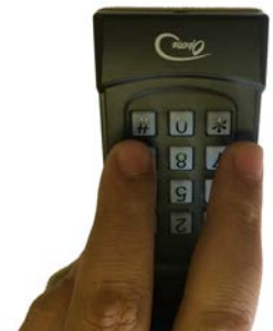
Figure 5 - Reset Keypad to Default Settings