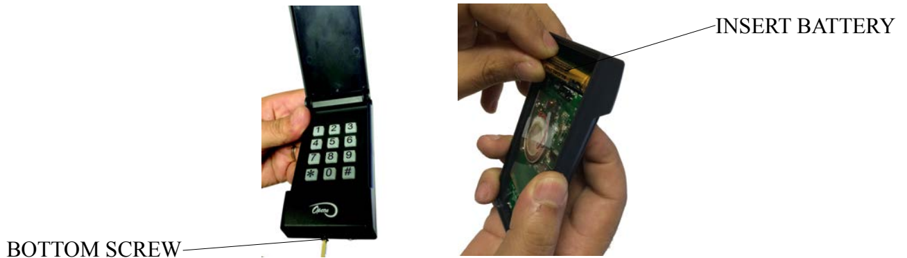
Figure 3 - KEYLESS042 Battery Installation