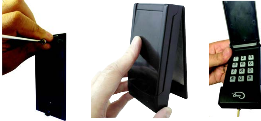
Figure 4 - Mounting KEYLESS042