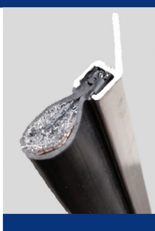
For complete protection of the facility, we recommend Xcluder Door Bottom Seals, Door Sweeps and Dock Leveler Seals for all dock and access doors.