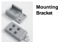
Four-Button Keychain Transmitter (Battery inside)

In this package, you will find a four button keychain transmitter with 12V alkaline battery and a mounting bracket.