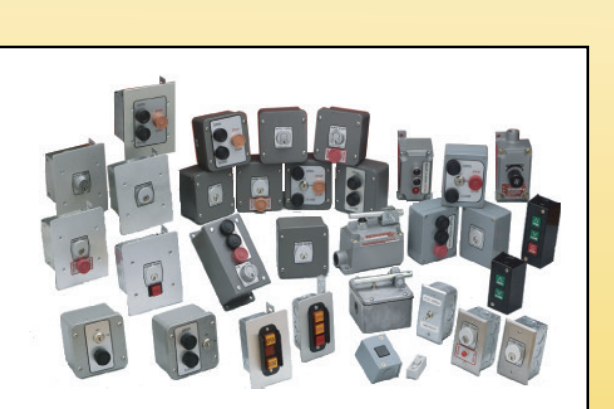
Complete selection of control stations & accessories are available.

All door operators are required to have a monitored safety system, such as monitored photo eyes and/or monitored 2 or 4 wire obstruction sensing edge. In addition, an ancillary device may be used. The primary device must be a constantly monitored, anti entrapment/safety device.